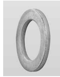
TYPE 1 Metal Retaining Washer