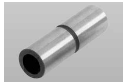
Steel (with lube hole) For use with roller bearing wheels