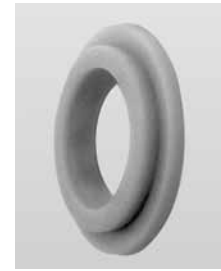
TYPE 2 Nylon Combination Retaining & Thrust Washer (Sealed)