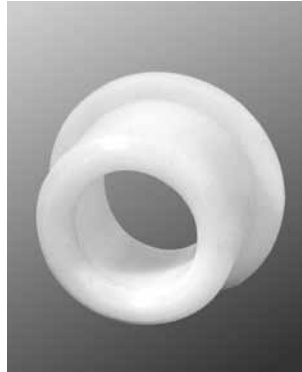
Flanged Delrin® Bearing