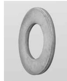
THRUST WASHER Flat, Zinc Plated