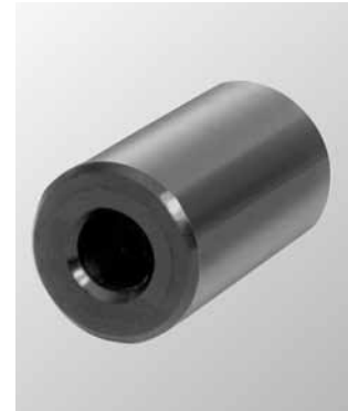
Straight Delrin® Bearing