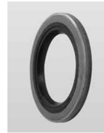
TYPE 3 Metal Retaining Washer With Neoprene Lip (Sealed)