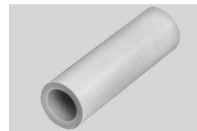
Delrin For use with Delrin bearing wheels

Note: For lubrication thru hollow axle, spanner bushing required with lube hole. Many sizes not shown are available, please inquire.